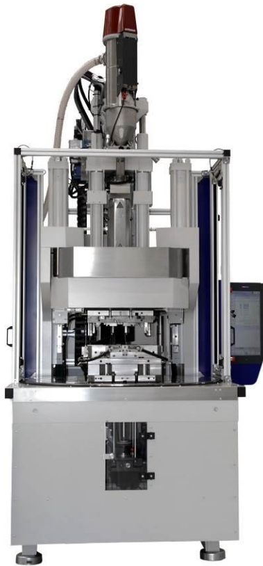
Fig. 1: The new CM 40 with rotary table and UNILOG B8 control system

At the K, the functionality of the new CM series will be demonstrated by a CM 40/210 R1280. On this machine, a connector housing made of PBT will be manufactured by insert molding with a 2-cavity mold. The machine is equipped with an insertion and parts removal automation system. A W821 robot from WITTMANN places the inserts into the mold, removes the finished parts and transports them to the WITTMANN W818 robot. This second robot picks them up with the help of a camera system and deposits them on trays.